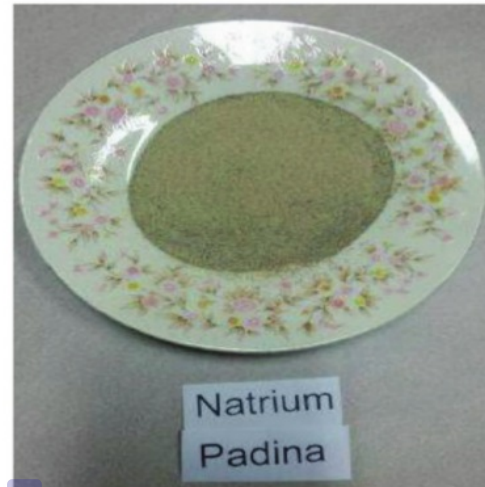
Figure 1 Sodium alginate extraction padina sp.

The research has been done in the Laboratory of Biopharmaca and Pharmaceutics Laboratory of Hasanuddin University Faculty of Pharmacy. The conducted resulted in the extraction of sodium